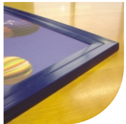
Plastic-frame ASV Lite is available in blue or white