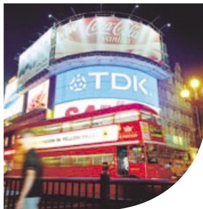
ASV Lite is based on the proven ASV transit™ advertising product range