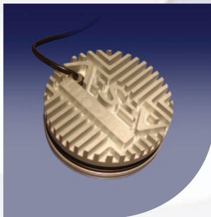
Cast aluminium back covers are pre-drilled and threaded to accept fixings